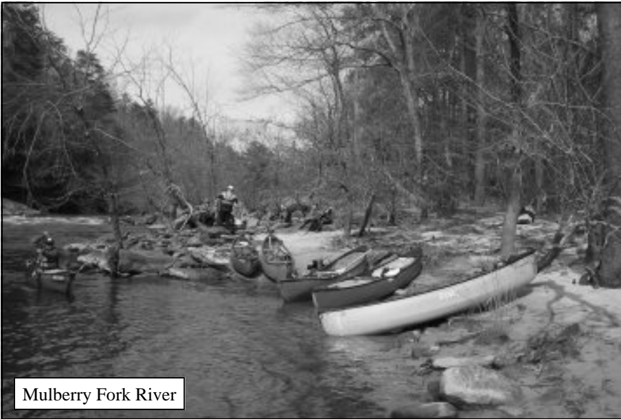
Mulberry Fork River