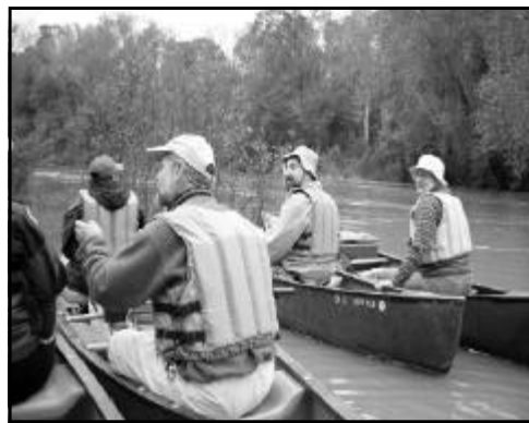
West AL Group and Cahaba River Society Float Saturday 11/13/2004

Note: This will be a joint outing with Birmingham Canoe Club.