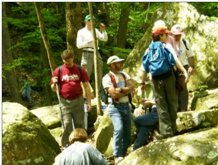
Another View from Buck's Pocket On our April 12 Wildflower Walk